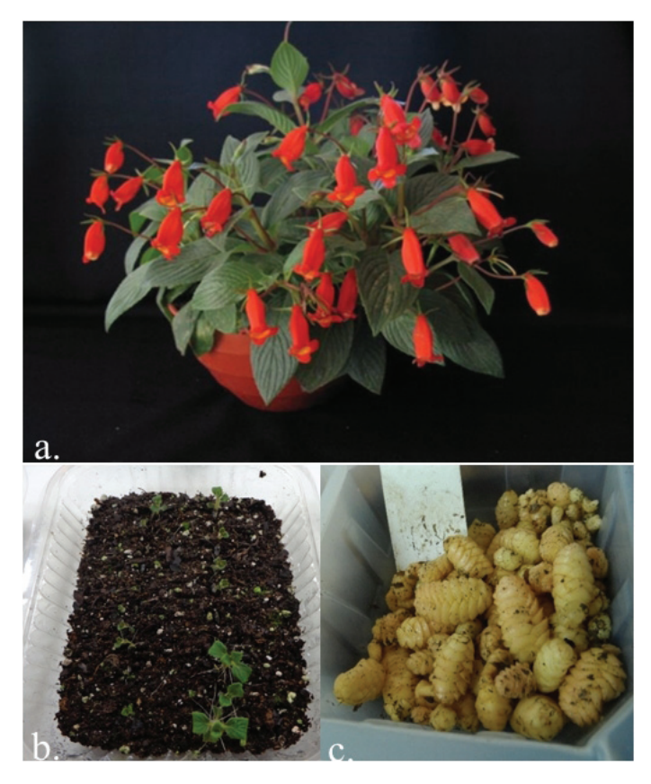
Figure 1. a) Seemannia hybrid. b) Sprouted scales grown in chamber. c) Rhizomes of the hybrid.

Plants of a selected hybrid between S. gymnostoma and S. nemathantodes from the breeding program that the Institute of Floriculture of INTA-Castelar (Argentina) carries out, were used for the assay. The hybrid was selected by its compact phenotype and intense red flowers (Figure 1a). The plants were obtained previously by cultivation of the scales in a breeding chamber with humidity and controlled temperature (22/24 °C day/night temperature, 16 h light cycle) (Figure 1b).