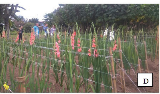
Figure 3. Technical visits to the gladiolus farms when were carried out planting (A), nitrogen fertilization, about 30 days after planting (B), support plants vertically with plastic net, about 60 days after planting (C) and harvest, about 80 days after planting (D).

As not all plants reached R2 on the same day, as the flowering period occurs within 15 days, farmers took the first stems to the fair one week before Mother's Day. An alternative for farmers with cold rooms in the property is the storage of the stems at low temperatures (approximately 6°C) to delay the opening of the florets until the day before the day of sale (Schwab et al., 2015b). However, since none of the farmers had a cold room, they started marketing at the fairs about a week before the intended date, using them as an attraction for consumers to return to the fair next week to buy flowers for Mother's Day.