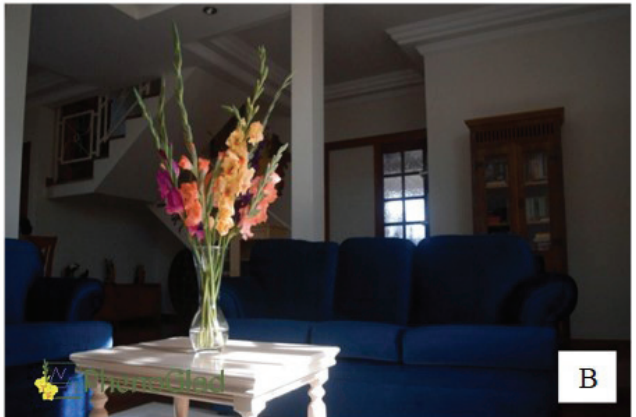
Figure 1. Different uses of gladiolus flowers stems: events ornamentation (A), and interior decoration (B).

One of the factors that prevents the expansion of the gladiolus in RS is the difficulty in determining the date of planting of the corms to harvest the floral stems at the desired date (Uhlmann et al., 2017). Environmental factors, such as air temperature, have a great influence on the length of the gladiolus development cycle, and for the State of Rio Grande do Sul, early-cycle cultivars have a cycle ranging from planting to harvest between 69 to 121 days, (Becker et al., 2017). It is important to use tools such as mathematical models to determine the optimal planting date (Becker et al., 2017). A